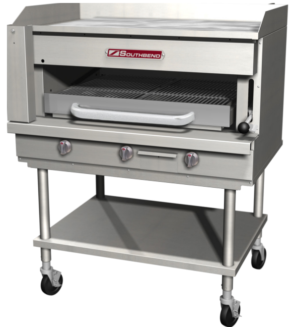
SSB-45 shown on standard equipment stand with optional casters.