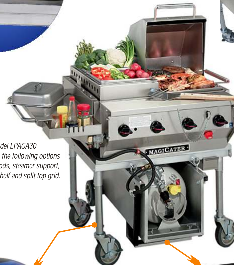
Model LPAGA30 Shown with the following options one 15" Hoods, steamer support, pans, side shelf and split top grid.

Dry Grease Removal System - Unique dry grease removal system eliminates the need for water tubs, transport of water and messy disposal.