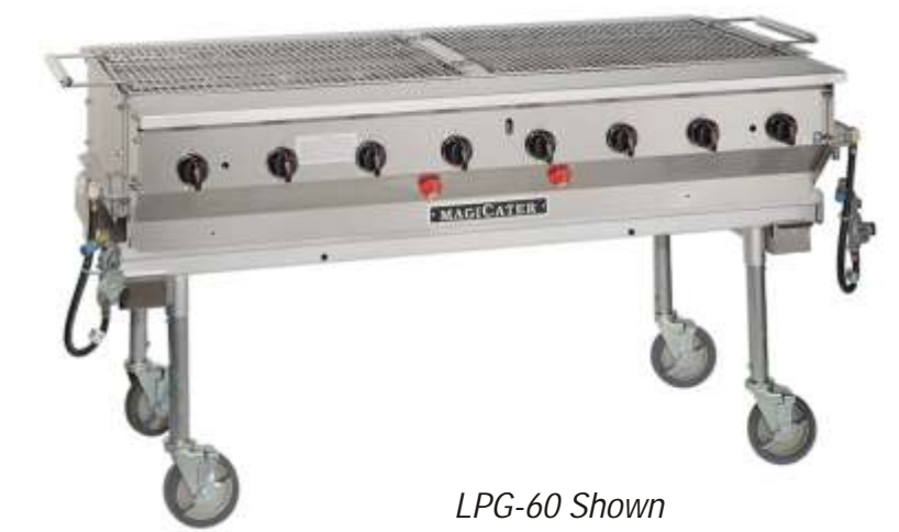
LPG-60 Shown Also available as a 30" model. Models available in Natural Gas.

Easy Lift Tank Cart Tank cart has a swing out handle and is on wheels to make refilling and set up easier. 30" Grills use a single 40# tank. 60" Grills use a dual 40# tank. Both grills available without tanks or in Natural Gas.