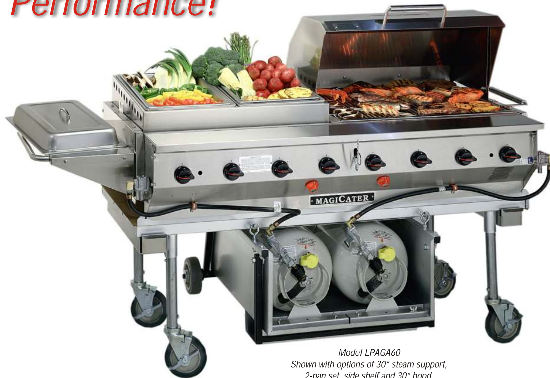
Model LPAGA60 Shown with options of 30" steam support, 2-pan set, side shelf and 30" hood.

Grill, Roast, Steam, Griddle, Hold Our job is to make you look good! Performance!