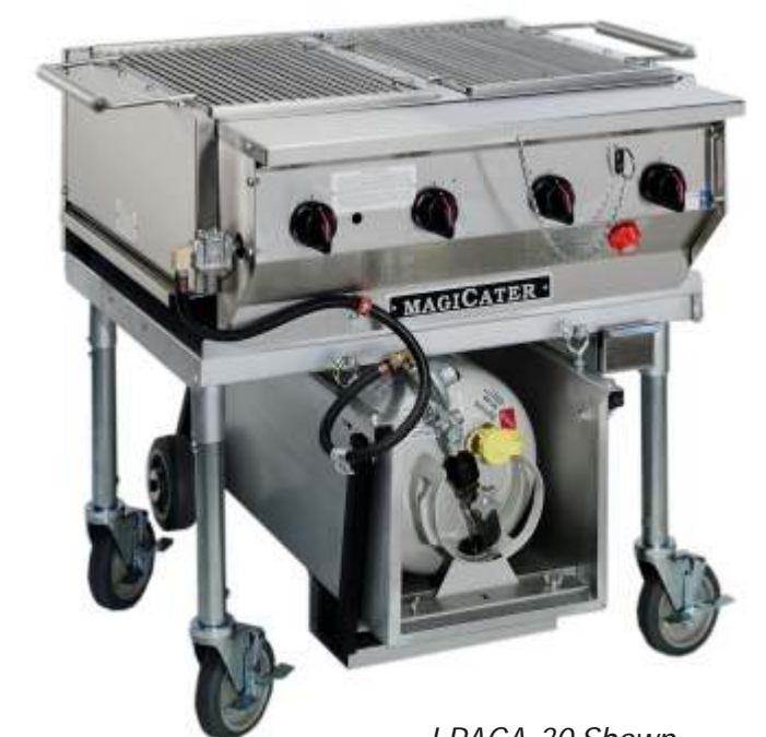
LPAGA-30 Shown Also available as a 60" model. Models available in Natural Gas.