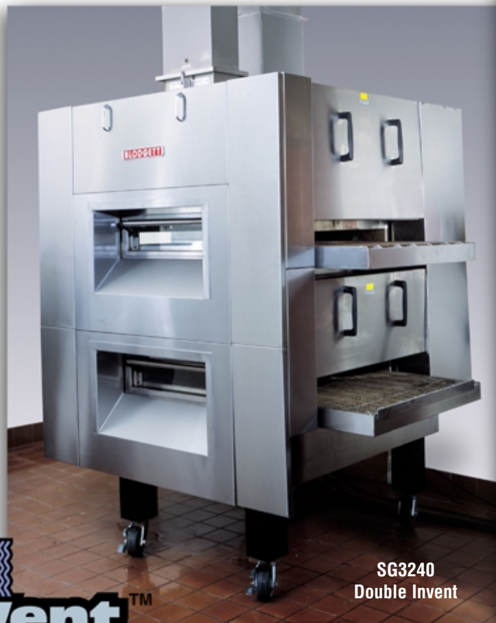
SG3240 Double Invent